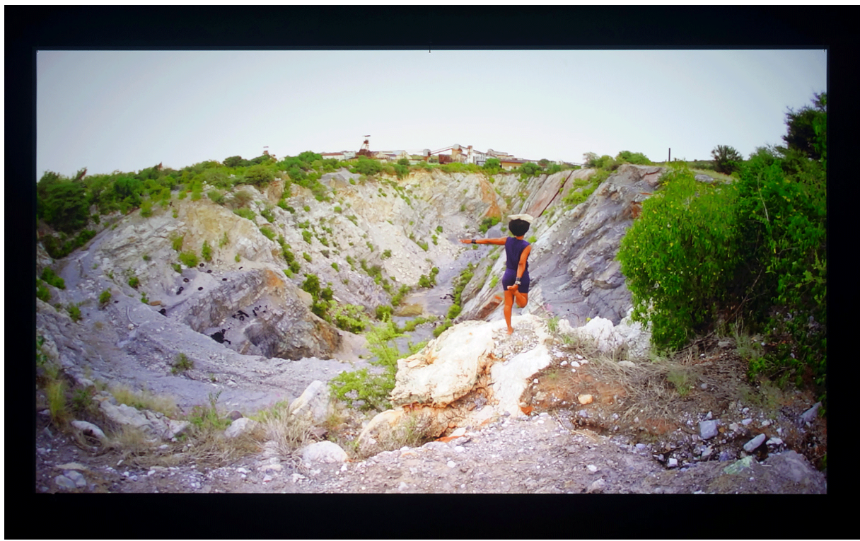
Otobong Nkanga, Remains of the Green Hill, 2015.

Featured in 'Dear Earth', Nkanga's vast tapestry Double Plot (2018) is based on an image of the solar system, taken by NASA in 2011. Light from distant, long-dead stars bears down on our corner of the cosmos, having journeyed here for many thousands of years, while four superimposed photographic discs depict scenes of contemporary civil unrest. Presiding over all this is an enigmatic headless figure, who we might interpret as a kind of puppet master, pulling on the strings of history. Looking at the work, we get to thinking that while the universe may be glimpsed from an infinite number of standpoints, both spatial and temporal, its every atom is nevertheless a part of the same whole. Nkanga relates Double Plot to 'thinking within African philosophy [about] time as a flat plane where everything collapses.' Like the starlight in her tapestry, 'your ancestors are part of your life in the present, and they are also the ones who show you the way into the future.' There are calls to action all around us, if only we have eyes to see and ears to hear.