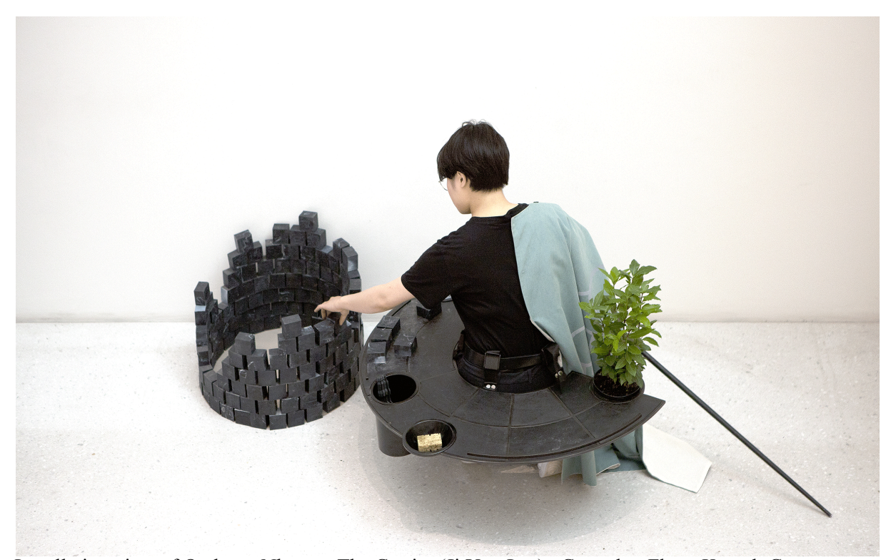
Installation view of Otobong Nkanga, The Carrier (Ji Yun Lee), Carved to Flow, Kassel, Germany, 2017.

Nkanga is firm that the foundation is for the people of Akwa Ibom, 'not something established with the international art world in mind'. Anybody who turns up at the farm can draw free clean water from its pumps, and charge their mobile phone from its solar-powered generators for a nominal fee. Local women sell the farm's produce at market, villagers are employed as laborers, and young people learn how food might be produced without the environmentally devastating, recklessly short-term techniques of industrial agriculture. The artist tells me that she wants the foundation to 'open up another way of looking at food, at the landscape.' While it is a practical project, rooted in a community's immediate, everyday needs, it's also 'a way of imagining what is possible,' and that at this perilous moment in our planetary story 'not all is lost'.