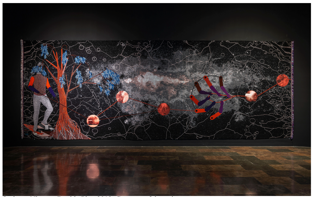
Otobong Nkanga, Double Plot, 2018.