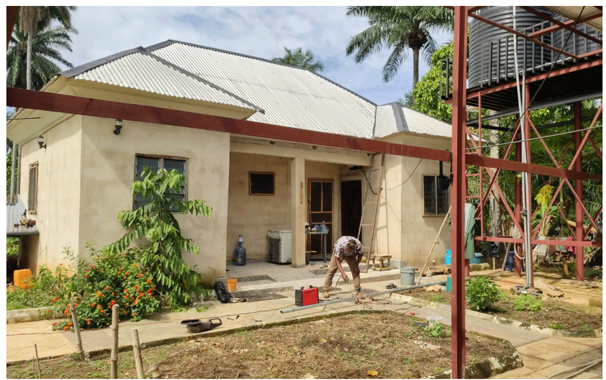
Carved to Flow Foundation land in Uyo, Akwa Ibom State, Nigeria.