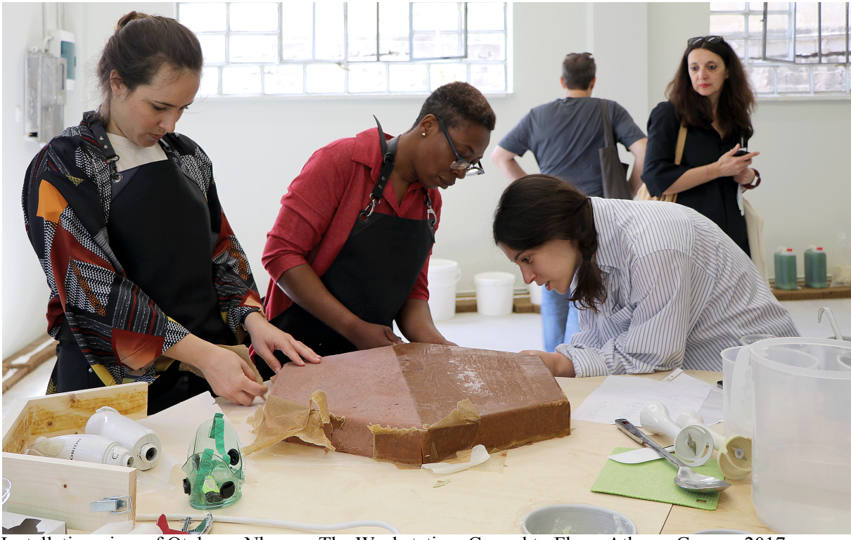
Installation view of Otobong Nkanga, The Workstation, Carved to Flow, Athens, Greece, 2017. Photograph by Wim van Dongen. Courtesy of the artist.

Perhaps her most visually striking project to date, Nkanga's 2021 solo exhibition at Kunsthaus Bregenz in Austria was themed around the four vertical oceanic layers, which range from the deep abyss to the near-surface sunlight zone. Its central feature was a 44-meter-tall mistletoe-choked tree, which appeared to rise from a stagnant pool on the ground floor, and push up through the first and second floor spaces before its leafless tip emerged into the upper gallery. Here, drifts of arid soil suggested a barren, uninhabitable landscape, and a tapestry entitled Unearthed – Sunlight (2021) combined woven images of a heat-scorched forest with tendrils of living ivy, a plant long associated with cemeteries. Nkanga says the show developed from contemplating what the bottom of the sea contains, including the drowned 'bodies of millions of people taken from the African continent and moved towards the Americas.' Over the centuries they have 'been transformed into minerals' and are now prone to being extracted from the seabed and put to (likely environmentally destructive) use.