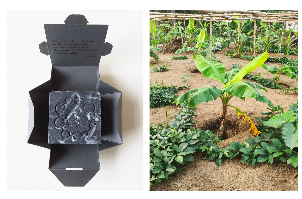
Left: Otobong Nkanga, O8 Black Stone, 2017. Courtesy of the artist. Right: Carved to Flow Foundation land in Uyo, Akwa Ibom State, Nigeria. Courtesy of the artist.

The ongoing project Carved to Flow (2017-) began life as part of documenta 14, an exhibition sited in both Athens and Kassel, Germany. Nkanga set up a laboratory in the Greek capital, developing prototypes of ten handmade cold process soaps from raw vegetable fats, herbs, and essential oils, set in hexagonal molds. From this emerged a marbled black soap she named 08 Blackstone , and in Kassel she created a series of tower- or well-like sculptures from some 15,000 bars, which were slowly sold to help fund two distinct, yet related initiatives. One is a nonprofit art space in Athens, Akwa Ibom, which takes its name from Nkanga's father's home village, and which she established with the curator Maya Tounta to stage key exhibitions of previously below-the-radar artists such as Thanasis Totsikas. The second is a foundation in the form of an organic farm outside the original Akwa Ibom in Nigeria, managed day-to-day by Nkanga's brother, Peter Nkanga, an investigative journalist. Using biodiversity-sensitive planting practices, it grows everything from African fluted pumpkins to plantains, pineapples to passion fruit trees.