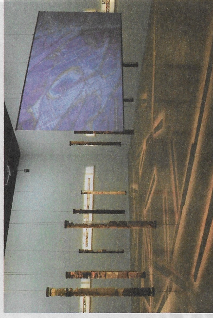
Installation view of the winning work, Unconformities (2017) at the Prix Marcel Duchamp exhibition, Centre Pompidou, Paris, 2017. Image courtesy of the artists